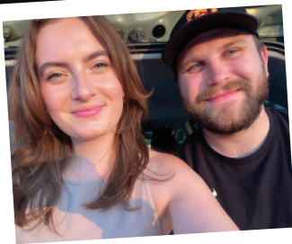
with my husband