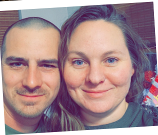
with my husband